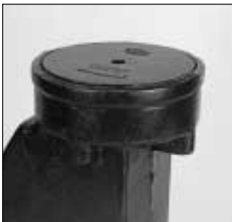
Top View With Cover