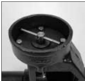
Top View Less Cover